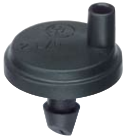
Agri Drip™ Standard Emitter