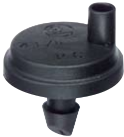
Agri Drip™ Pressure Compensating Emitter